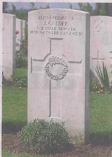
John Calder's headstone at Tyne Cot Cemetery in Belgium.

■ You can find SCRoll stories, hosted by the South Canterbury Museum, at museum.timaru.govt.nz/scroll