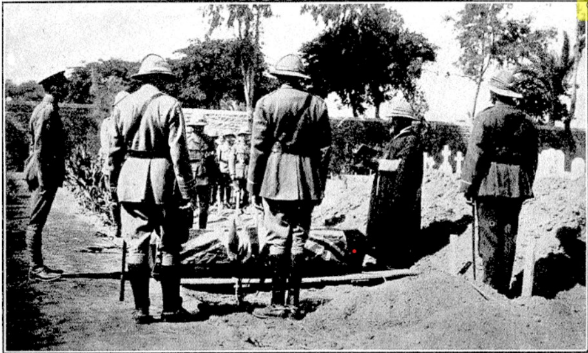
BURIAL OF MAJOR BOWIE , OF THE EIGHTH SOUTH CANTERBURY MOUNTED RIFLES. WHO DIED OF DYSENTRY AT CAIRO.

Otago Witness . 15 Sep 1915 (PP) [12/07/2023]