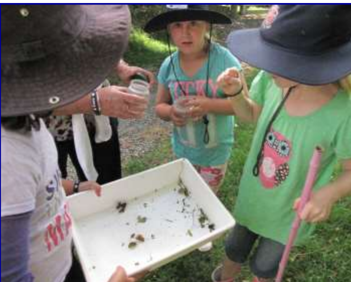
Below: Waimate Centennial School students discover small forest creatures at Kelcey's Bush.