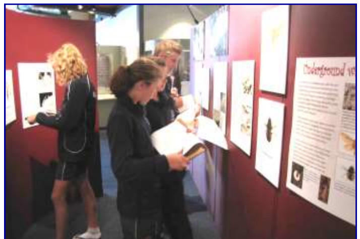
Below: Craighead Diocesan School students research invertebrate life in the Wild Suburbia exhibition at the South Canterbury Museum.