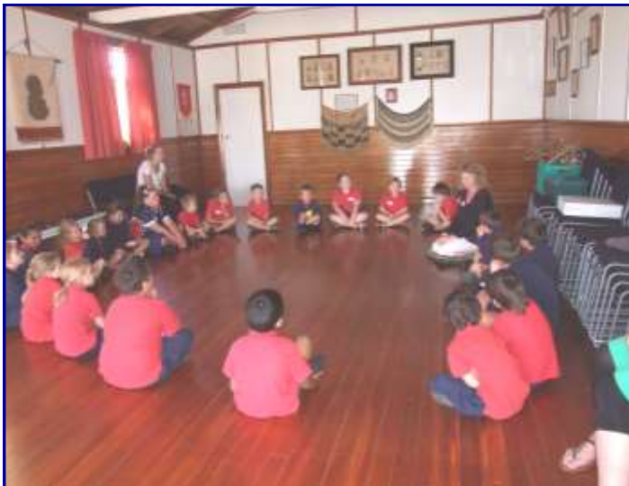
Below right: Getting hands-on with a live darkling beetle at Northaven Kindergarten in Timaru.