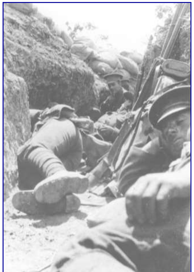
Above: An iconic image of soldiers resting in the trenches at Gallipoli, taken by Ernest Gibson (courtesy of Canterbury Museum)

We are continuing to commemorate the First World War by taking a closer look at the stories of local men who served in the Gallipoli campaign 100 years ago. The Gallipoli campaign is highly significant in New Zealand's military history. There are a number of poignant stories of local men who served, some not returning from the field. The exhibition will also feature a number of images taken by Timaru man Ernest Gibson.